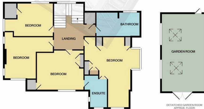
1ST FLOOR APPROX. FLOOR AREA 886 SQ.FT. (82.3 SQ.M.)