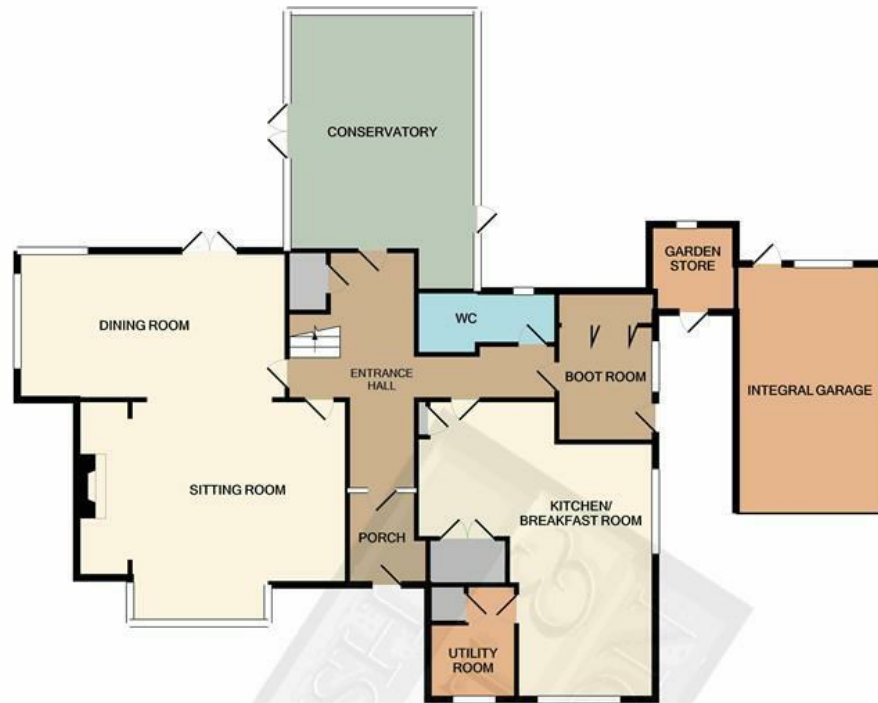
GROUND FLOOR APPROX. FLOOR AREA 1343 SQ.FT. (124.8 SQ.M.)